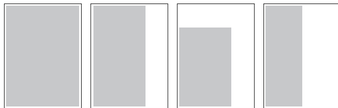
FULL PAGE 7.875" x 10.75" 2/3 PAGE 4.5" x 10" 1/2 PAGE ISLAND 4.5" x 7.5" 1/2 PAGE VERT. 3.375" x 10"